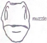
Hind rear view