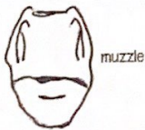
Hind rear view