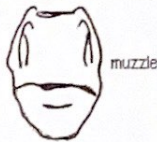
Hind rear view