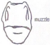
Hind rear view