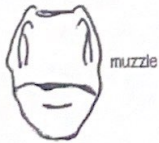
Hind rear view