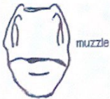
Hind rear view