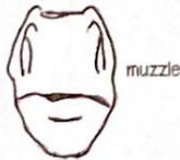
Hind rear view