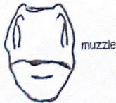
Hind rear view