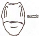
Hind rear view